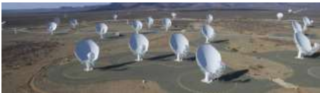
Figure 1: Overview of MeerKAT radio telescope

For SKA Phase 1, Australia will host the low-frequency instrument with more than 500 stations, each containing around 250 individual antennas, whilst South Africa will host an array of some 197 dishes, incorporating the 64-dish MeerKAT precursor telescope.