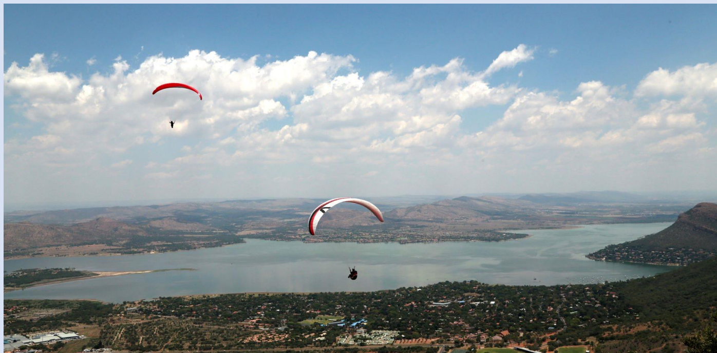
View from the upper cable station