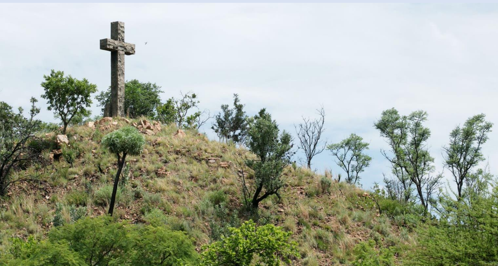
The Schoeman Cross