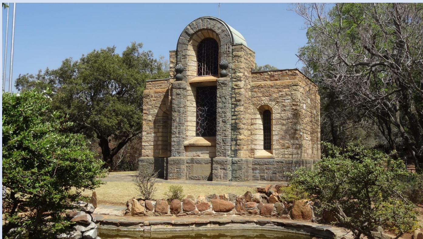
Sappersrus Memorial Hall