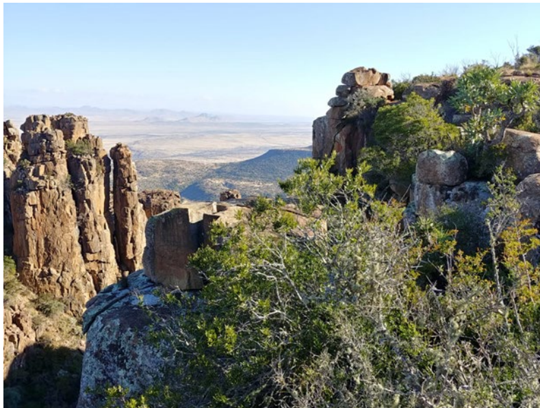
The valley of desolation