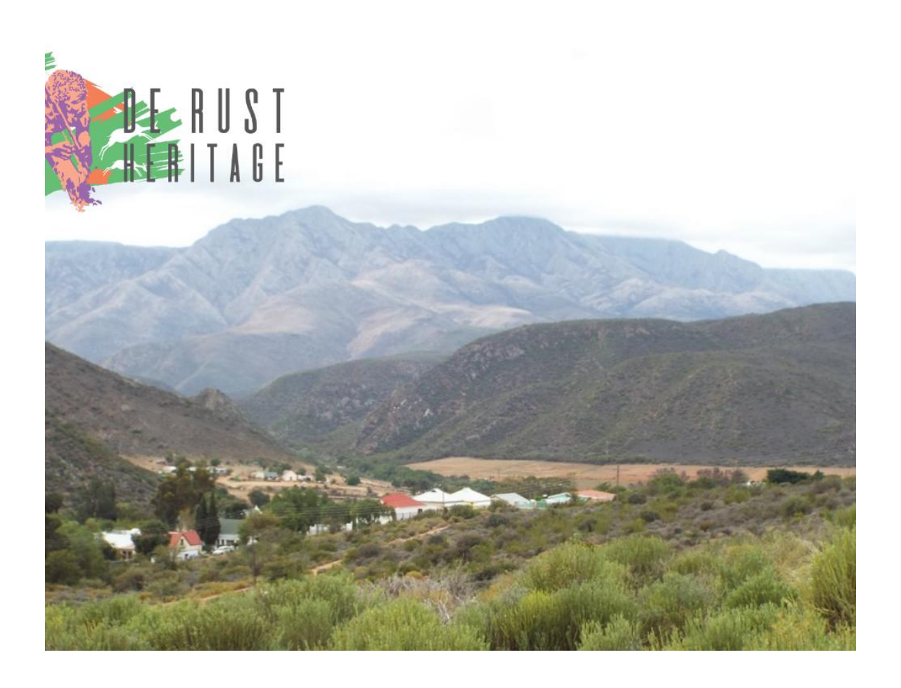
Our Heritage is Worth Preserving

De Rust Heritage thanks you for your interest in preserving Our Heritage for Future Generations