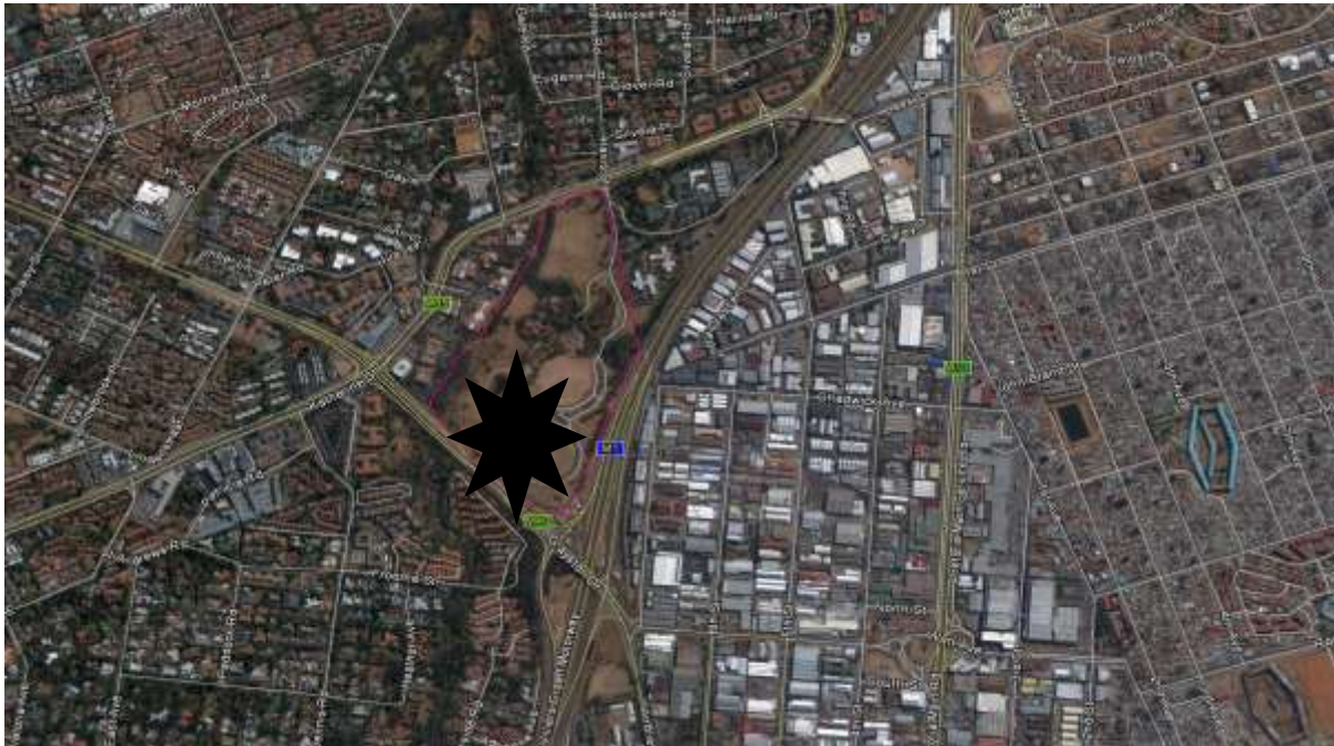
Figure 1: site location