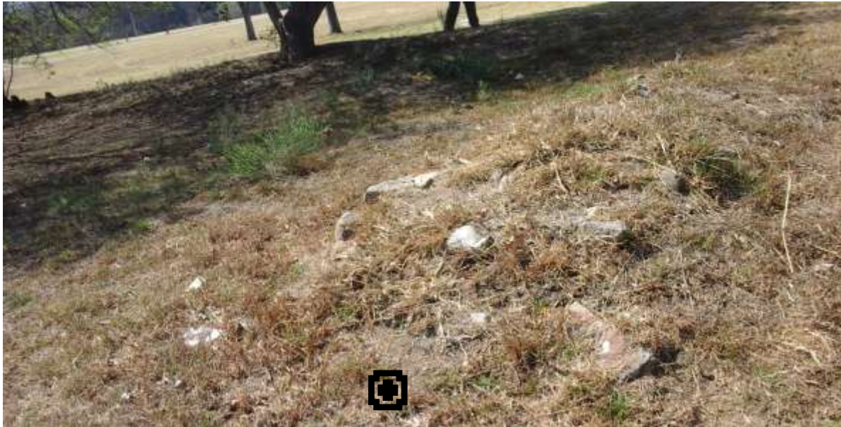
Photo 2ba: Indicative position of graves not highlighted in Photo 1a