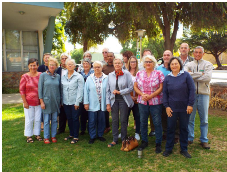
Members Attending the Heritage Certificate Program