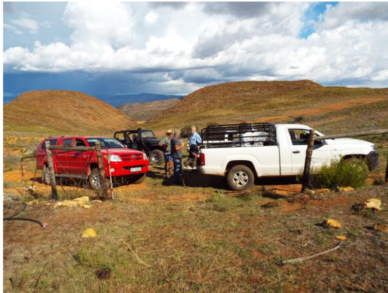
Volunteers Checking the Trail Run Course

Preparations for the “Meiringspoort Challenge” on Saturday 25 May, 2019 are well advanced with the checking of the trail section in the Swartberg near De Rust having been carried out in the last few days.