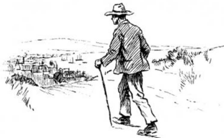
The De Rust Walking Trail Booklet

This booklet is available from De Rust Heritage at a cost of R 35.00 each which will support the next run of the booklet. It is also available at Rouge Karoo in Schoeman Street next to the Tourism Office as well as at Rawson Estates .