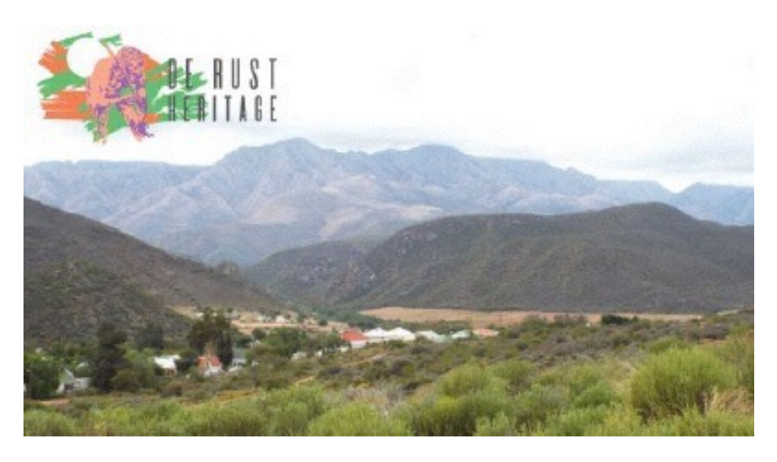
"De Rust Heritage Now" April Newsletter # 4/2019